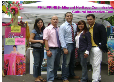
The popular Blackbird Pond Band from Norfolk, Virginia visited the MHC Cultural Interactive Tent and delightfully sampled the Philippine "Halo-Halo"